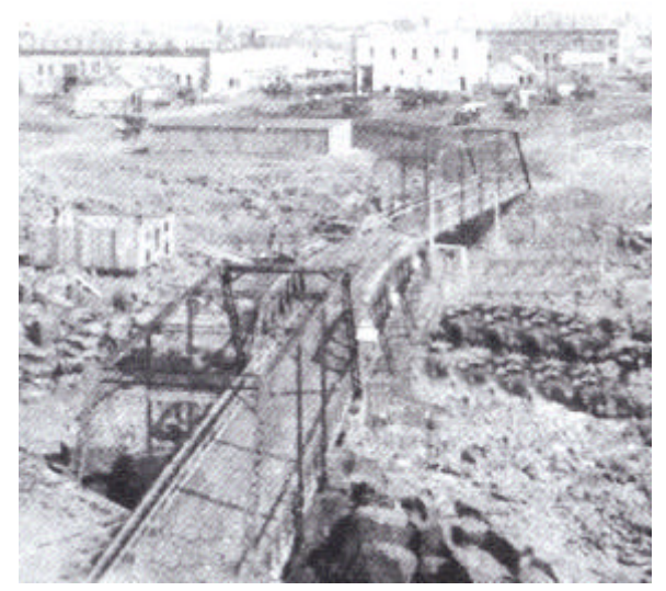
Eagle Rock's (Idaho Falls) 1st Steel Bridge

On May 22, 1886, a tremendous wind storm swept over Eagle Rock, blowing the roof off the Taylor home and wrecking havoc on the railroad's round house. The decision was made not to rebuild the railroad's round house in Eagle Rock. It was rebuilt 50 miles south, in the town of Pocatello. Pocatello later became the Gate City of Southeastern Idaho. Pocatello's growth soon skyrocketed from just the few buildings that were there before the railroad made the decision to move its roundhouse and repair shop there. The next year, Eagle Rock's population dropped from 2,000 to 400. Eagle Rock was not hurt too long, as it soon became the jumping off point to Yellowstone Park. Many homesteads were taken up for farming, in and around Eagle Rock. Eagle Rock now started to become an important