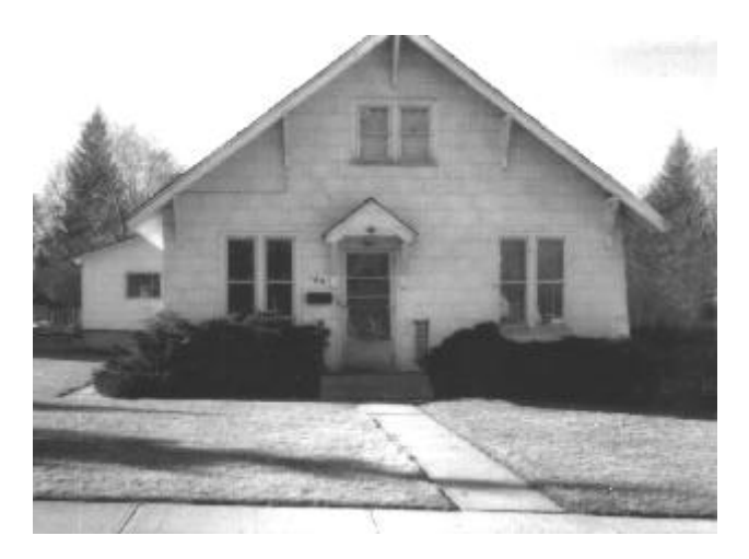
White Gifford Home built around 1916

down, but it must have been around 1917. As I remember, Alvin built a two story house just back of the adobe house.